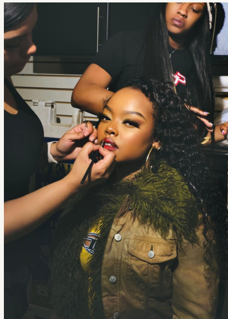
UNIVERSAL SEW IN