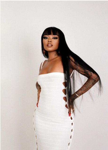
LEAVE OUT SEW IN