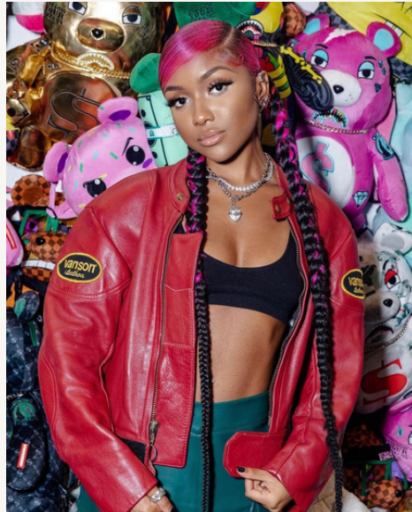
TWO BRAIDED PONYTAILS